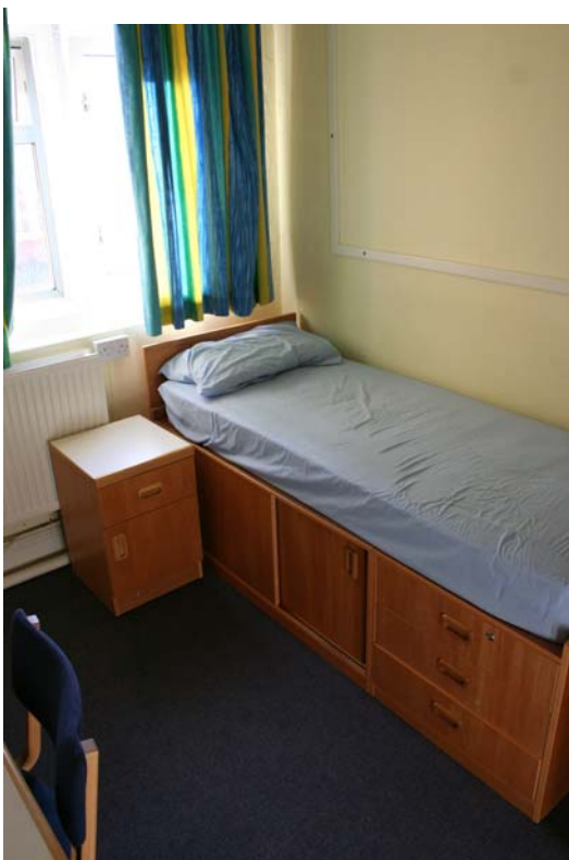
One of the single bedroom at Roedean