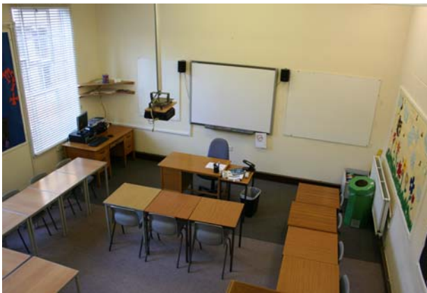
One of the many spacious classrooms