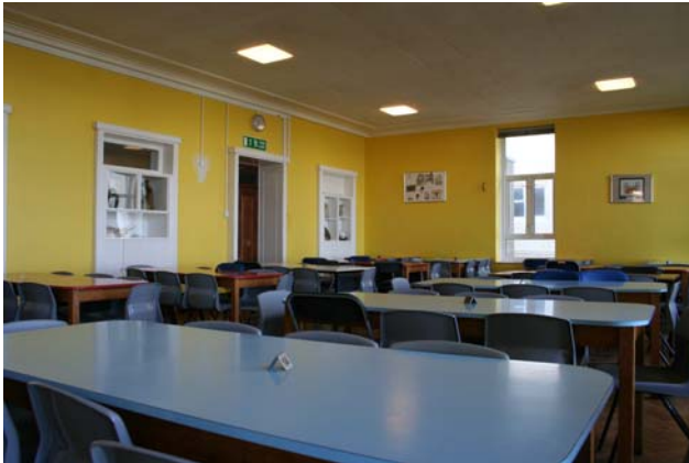
The bright dining hall