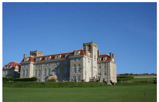
The school overlooks views of the English Channel