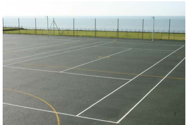
Tennis courts with a sea view